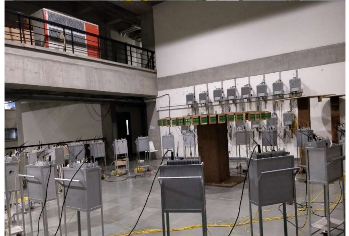
Fig. 1 Massive MIMO Testbed at Institute